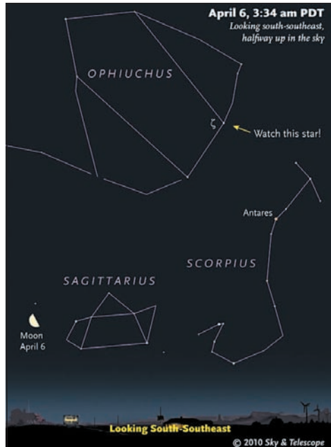
This is what scientists were watching for on April 6.

"That's how science is done," said Durbano. "You make observations, collect data, use that data to make predictions, make more observations, collect